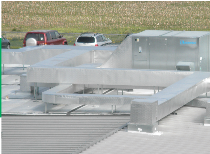
Mechanical upgrades including Energy Recovery Unit to condition outside air