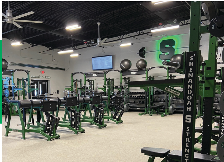
Design Build construction of new Weight Room