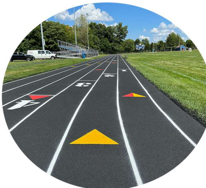
Clermont Northeastern Track

"We failed two public bids before bringing Prodigy in to rescue the project."