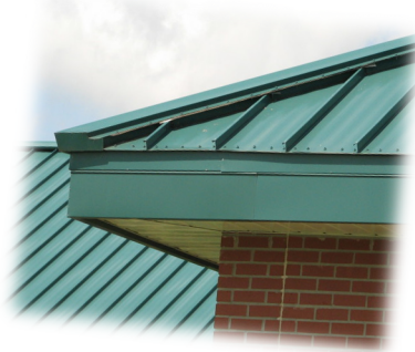
Infrastructure & Roofing