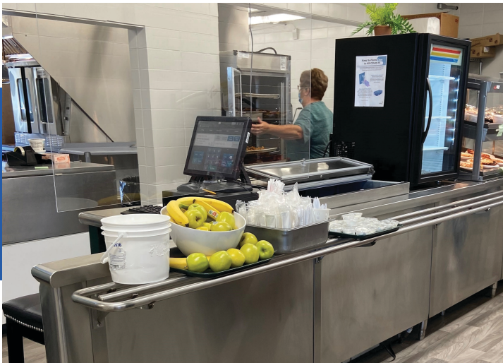
Kitchen renovations including flooring, painting, and all new kitchen equipment