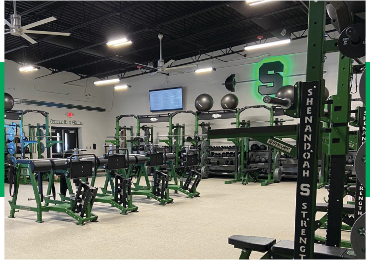
Design Build construction of new Weight Room