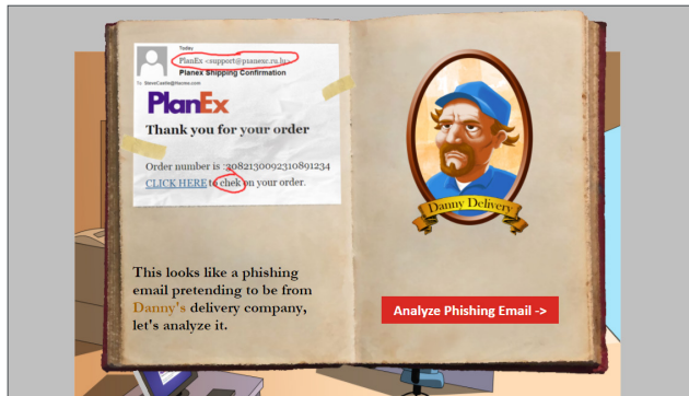
Engage users with a selection of interactive training modules

Over 60 interactive training modules will educate users about specific threats, such as suspicious emails, credential harvesting, password strength, and regulatory compliance. Available in a choice of 10 languages, your end users will find them informative and engaging, while you'll enjoy peace of mind when it comes to future real-world attacks: