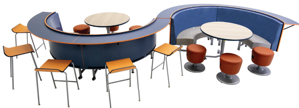
HMBS244 WITH OPTIONAL TABLES, CHAIRS AND STOOLS

Transform your environment this year into a modern, popular, and fun space for your students with AmTab .